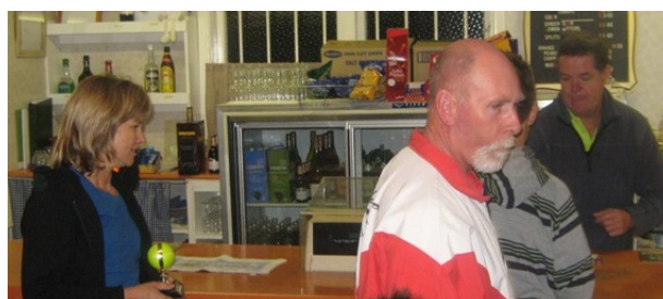
Some of winning team rushing to bar to celebrate